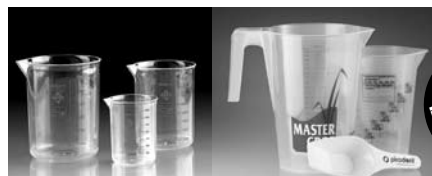
Beakers, Pitchers, Scoops, Funnel and more of various materials

Details at www.brandtech.com or call for a catalog of our line of PFA, Volumetric & General Laboratory plastic products, including bottles, beakers, sample vials, funnels and scoops.