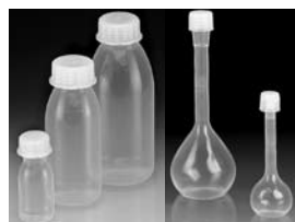
PFA Labware for Trace Analysis