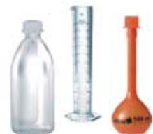
Volumetric & General Lab Plastics