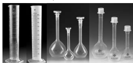
Class A & B Graduated Cylinders and Class A & B Volumetric Flasks with stoppers or screw caps

Details at www.brandtech.com or call for a catalog of our line of PFA, Volumetric & General Laboratory plastic products, including bottles, beakers, sample vials, funnels and scoops.