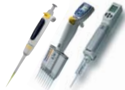
Manual, Electronic & Repeating Pipettes