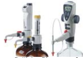
Bottletop Dispensers & Burettes

BrandTech Scientific — Your ACE in the RAT RACE!