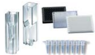
Life Science Plastics