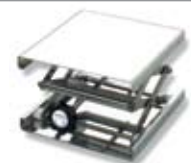
Stainless Support Jacks